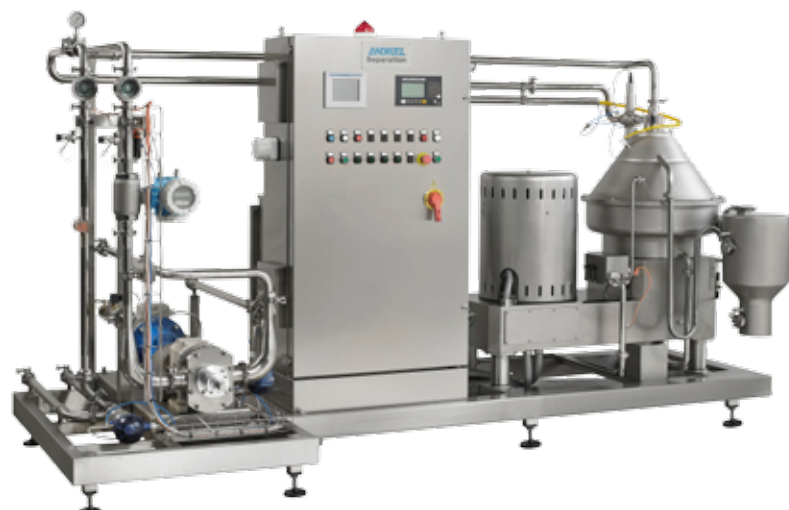
▲ Craft beer clarifier skid example