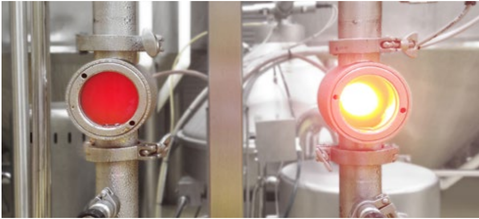
▲ Craft beer clarifier skid

As trends in beer are fast changing, and customers are demanding when it comes to new flavors, colors or types of beer – it is time for an easier, more flexible approach to beer clarification in craft brewing. The beer clarifier skid from ANDRITZ SEPARATION is a high quality, simple to operate, plug and play beer clarification solution for your brewery. Combining efficiency and ease of maintenance – the clarifier skid is the right ingredient for your success in the craft brewing industry.