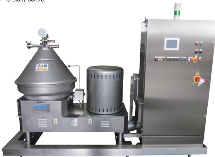
▲ Coconut water separator model CA41 S