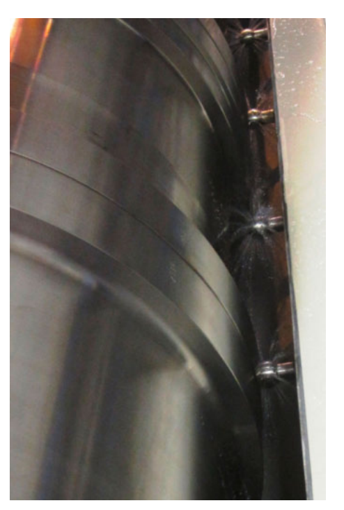
▲ CIP system