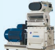
▲ Hammer mill