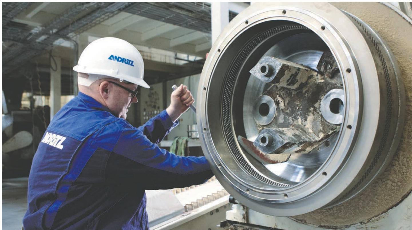
▲ Service and support