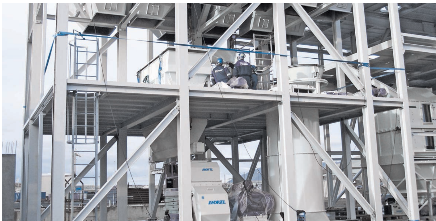
▲ The ANDRITZ concept