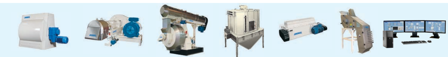
▲ Optimix ▲ Feed expander ▲ Pellet mill ▲ Cooler ▲ Crumbler ▲ Micro-fluid addition ▲ Process automation

driven and gear-driven models available, matching any possible feed plant preference. Capacity: up to 100 t/h.