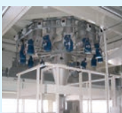
▲ Weighing unit

with addition of high amounts of liquids. Capacity: 0.5-40 t/h. Batches: 0.1-6 t.