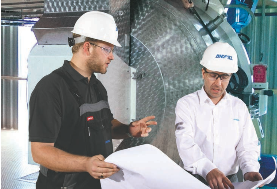
▲ Together, we make a difference

ANDRITZ is one of the world's leading suppliers of technologies, systems, and services relating to advanced industrial equipment for the animal feed industry.