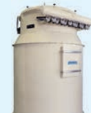
▲ Aspiration filters