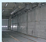
▲ Bulk intake system