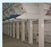
▲ Ingredients silos