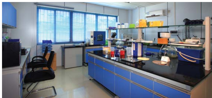
▲ Fast and accurate testing of pulp in a local state-of-the-art laboratory

The lab is able to provide physical and chemical property tests for all types of stock. Our mission is to offer reliable and consistent laboratory test services to paper mill customers in Asia and to support start-up and commissioning, performance testing, and system optimization.